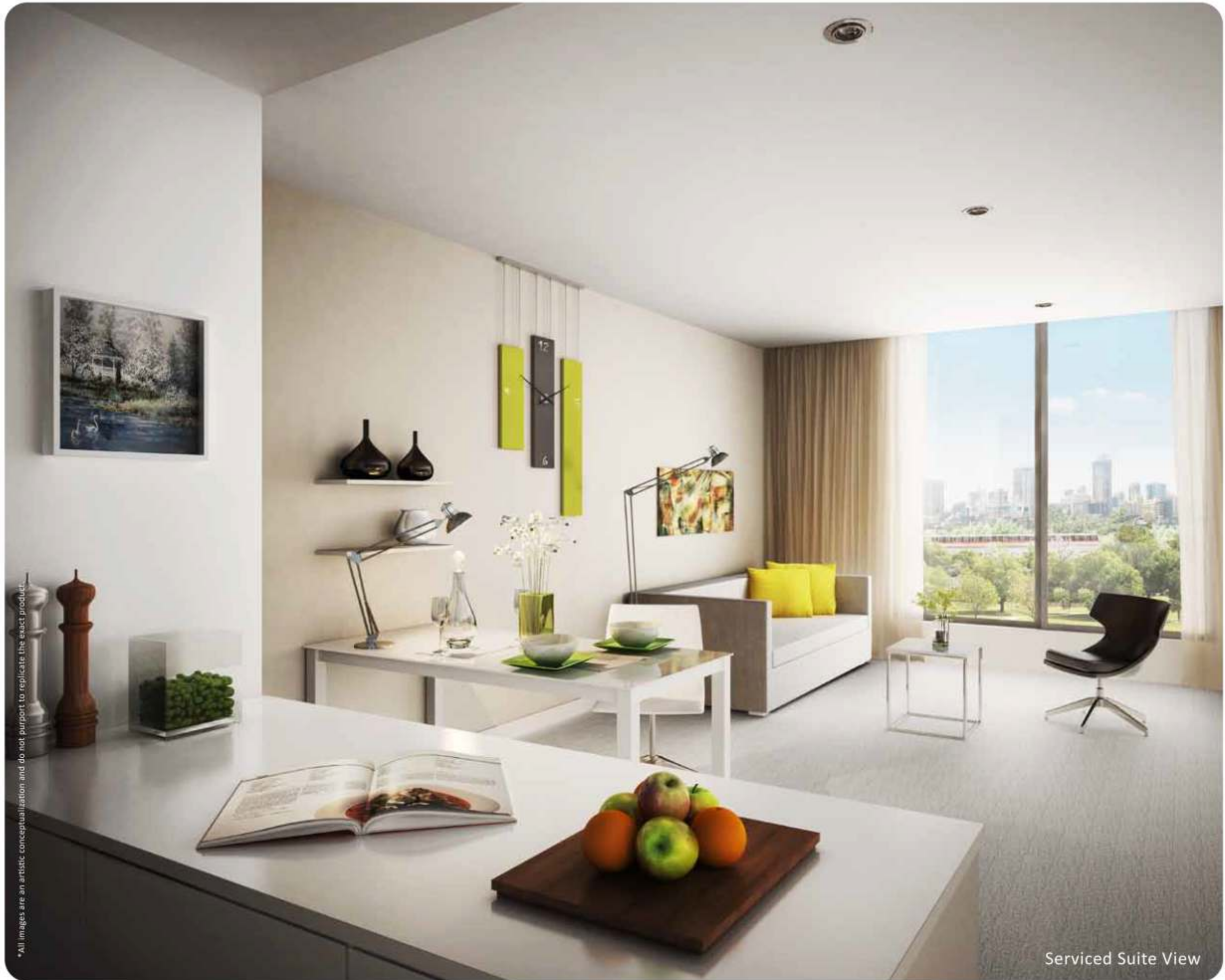
Serviced Suite View

* All images are an artistic conceptualization and do not purport to replicate the exact product.