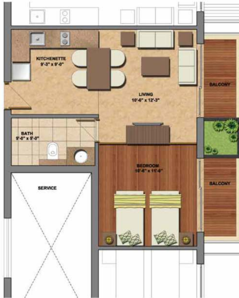
1 BHK Size - 795 Sq. ft.